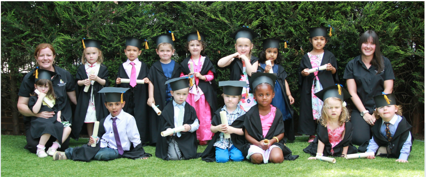
Class of 2013. Every year we celebrate our pre-school children leaving with a Graduation ceremony and garden party